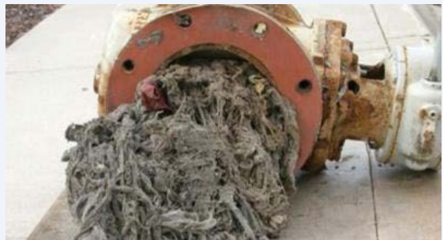
A mass of flushable and disinfectant wipes clogs a pipe.

If a personal sewer lateral backs up, it is the property owner's responsibility and can be very costly.