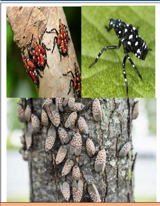
SLF material giveaway runs from May 15<sup>th</sup> to October 1<sup>st</sup> (or until supplies run out)